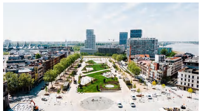
Figure 1: Antwerp Zuiderdokken - cars underground

And with our focus on 'Seamless Parking Services' we ensure that our digitalisation and innovation efforts are geared towards a seamless parking experience for our customers. Providing digital access and payment services, via our tools or payment services of our partners.